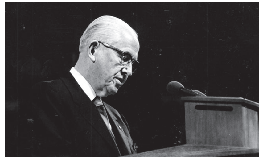
President Ezra Taft Benson

Perhaps impacting and definitely supporting his statements on the importance of this antidote, President Benson consulted articles from non-LDS sources, which he included with LDS sources in a file labeled “Humility.” Marked passages in the article “The Best Advice I Ever Had” by Carlos P. Romulo, chair of the Philippine Delegation to the United Nations, read, “In my contacts with men of all walks of life I observed that it is always the small man, the mediocre, who is arrogant and conceited, who does not know how to bend. The truly great man is tolerant, humble and modest.” He concluded that “only where there is humility can there be peace.” 93 President Benson included in his research another non-LDS author who praised the importance of humility to greatness: Rudyard Kipling, who wrote the poem “Recessional” to remind his