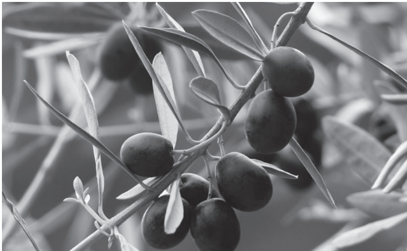
The branches represent individuals and families which are able to bring forth fruit.

as I suggest in this paper: as a dual representation of the Church, where the branches stand for the members and the roots symbolize the Church as an institution with its priesthood channels.