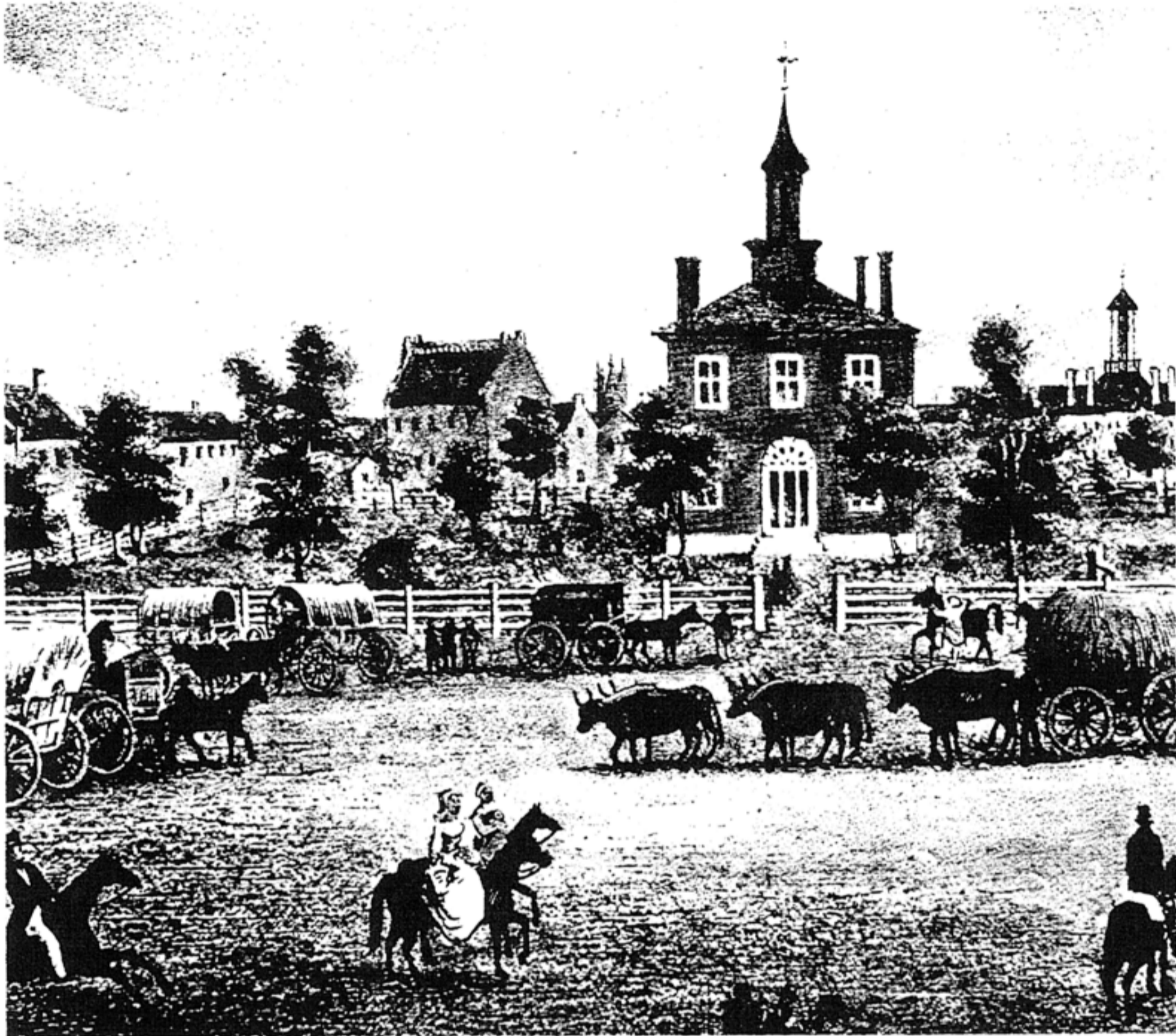
The second brick courthouse on the square in Independence, Missouri, as pictured by an unknown artist, c1850.