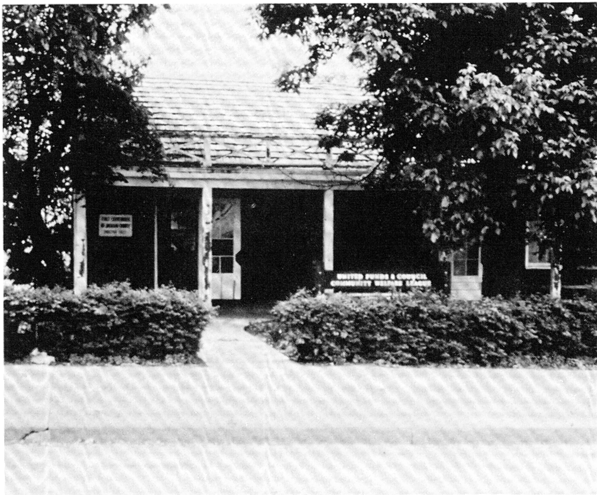
The first Jackson County Courthouse as it appears today.

built only as a temporary frontier facility, has been preserved by an historical society [see illustration #1], and that a third courthouse—the second permanent brick structure—was immortalized in about 1850 by an unknown artist's etching [see illustration #3]. This rendition has been widely reprinted and sometimes mistakenly designated as the first permanent brick courthouse. 2