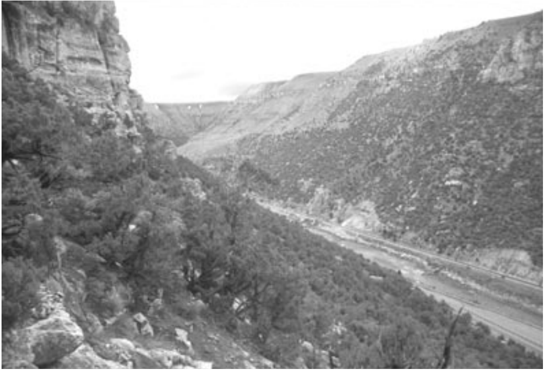
Fig. 2. Photo of lower Wind River Canyon near midden-collecting sites. Woodlands in foreground and background are dominated by Juniperus osteosperma . View is facing upcanyon, WNW.

at cliff bases and in draws. Scattered individuals of Pinus flexilis occur throughout the canyon but are not abundant on the lower slopes where we concentrated our collecting efforts. Other plant species on the slopes include shrubs ( Ribes aureus [at cliff bases], Artemisia frigida , Atriplex canescens , Chrysothamnus spp., Gutierrezia sarothrae ), grasses ( Oryzopsis hymenoides , Bromus tectorum , Stipa comata , Elymus sp.), forbs ( Artemisia ludoviciana , Cryptantha spp., Eriogonum spp., Pentstemon spp.), and succulents ( Opuntia polyacantha ).