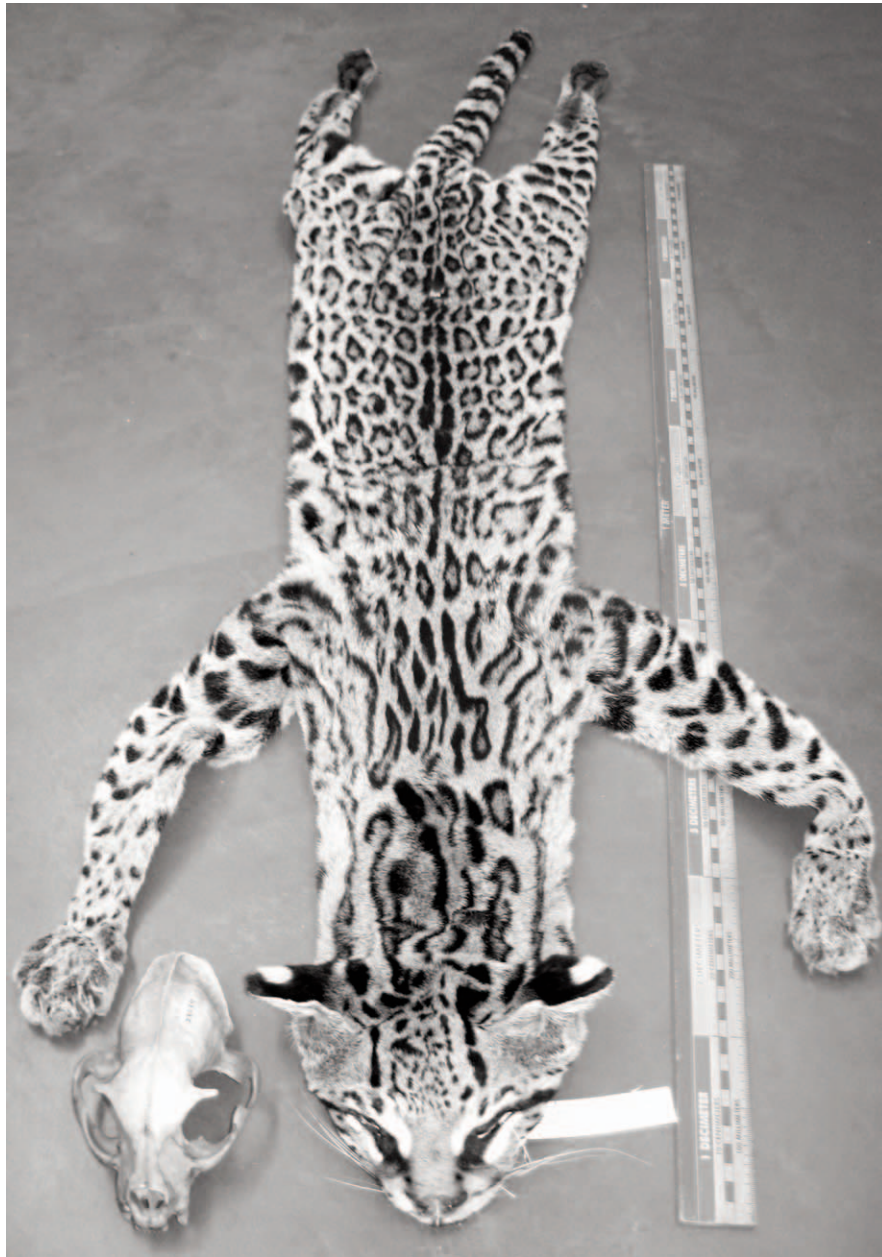
Fig. 1. Tanned hide and skull of Leopardus pardalis (MWSU 23034) recovered from Palo Pinto County, Texas, on 28 March 2010.

agricultural value. The Brazos River enters the region near Waco and meanders to the north and west, through Palo Pinto County near the collection site, and beyond to the mesquite savanna of the Rolling Plains.