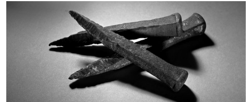
Matt Reier, © Intellectual Reserve, Inc.

the most frequented roads are chosen, where the greatest number of people can look and be seized by this fear. For every punishment has less to do with the offence than with the example.” 18