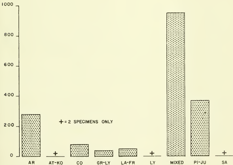
Fig. 1. Relative abundance of Eurybunus riversi in nine plant communities at the Nevada Test Site. (AR = Artemisia tridentata , AT-KO = Atriplex confertifolia — Kochia americana , CO = Coleogyne ramosissima , GR-LY = Grayia spinosa — Lycium andersonii , LA-FR = Larrea divaricata — Franseria dumosa , LY = Lycium pallidum , MIXED = other areas of a diversity which does not permit assignment to a specific community, PI-JU = Pinus monophylla — Juniperus osteosperma , SA = Salsola kali ).

Two species are known from the Nevada Test Site. Eurybunus