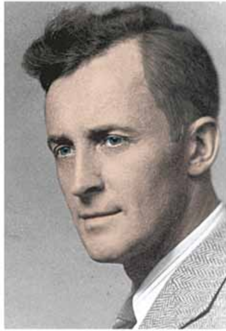
Hugh Nibley, ca. 1947.