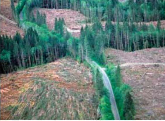
Clearcut logging on the Olympic Peninsula. Nibley was profoundly affected by his grandfather's logging methods in the Northwest.

of the terms, he further pointed out that the words refer to one who is “the lord of a household,” one