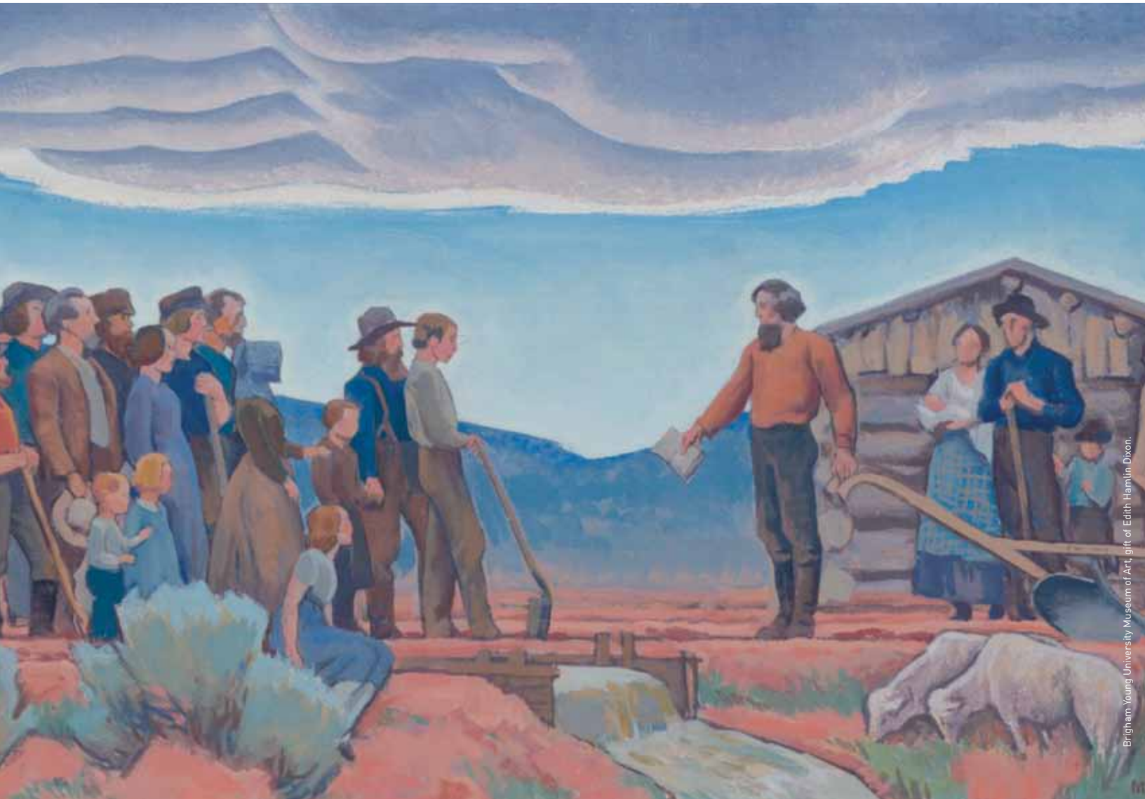
Brigham Young taught the Saints to care for and respect the land that they were struggling to make fruitful. Maynard Dixon (1875–1946), The Hand of God , 1940, oil on masonite, 21 x 39 1/8 inches.

Brigham Young University Museum of Art, gift of Edith Hamlin Dixon.