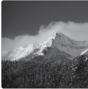
On the cover: Cloudy Victoria Peak in the Canadian Rockies.