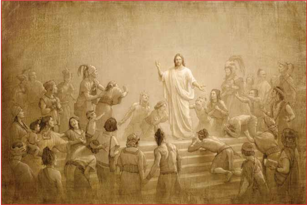
Christ in America. Illustration by Joseph Brickey.

of Christ just hours earlier inviting them to return to him and be converted (3 Nephi 9:13). Those who are converted “are willing to mourn with those that mourn; yea, and comfort those that stand in need of comfort” (Mosiah 18:9). Even if those near Bountiful somehow fared better than those in other parts of the land, we would expect them to do all they could to alleviate suffering. This is what their righteous ancestors had done when outlying lands were under attack (see, for example, Alma 60 and 61.)