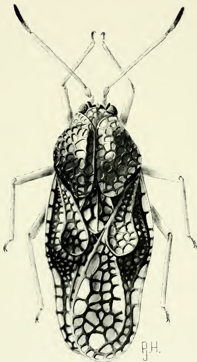
Fig. 1. Naochila arete , n. sp.