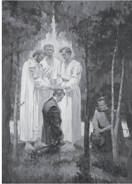
The Apostles Peter, James, and John bestowed the higher priesthood authority on Joseph Smith and Oliver Cowdery.

“And who gave you this authority?” the elders asked Christ (NIV, Matthew 21:23). Joseph Smith answers frankly, baldly, thus: “The reception of the holy Priesthood [came] by the ministring of Aangels.” 8 In his now-canonized history, Joseph Smith remembered the events of May 1829 as he and scribe Oliver Cowdery were translating the Book of Mormon from ancient metal plates revealed by an angel. “We . . . went into the woods to pray and inquire of the Lord respecting baptism for the remission of sins, that we found mentioned in the translation of the plates. While we were thus employed, praying and calling upon the Lord, a messenger from heaven descended in a cloud of light, and having laid his hands upon us, he ordained us” (Joseph Smith—History 1:68). Joseph continued his matter-of-fact narrative, noting how the angel “said this Aaronic Priesthood had not the power of laying on hands for the gift of the Holy Ghost, but that this should be conferred on us hereafter; and he commanded us to go and be baptized, and gave us directions that I should baptize Oliver Cowdery, and that afterwards he should baptize me.”