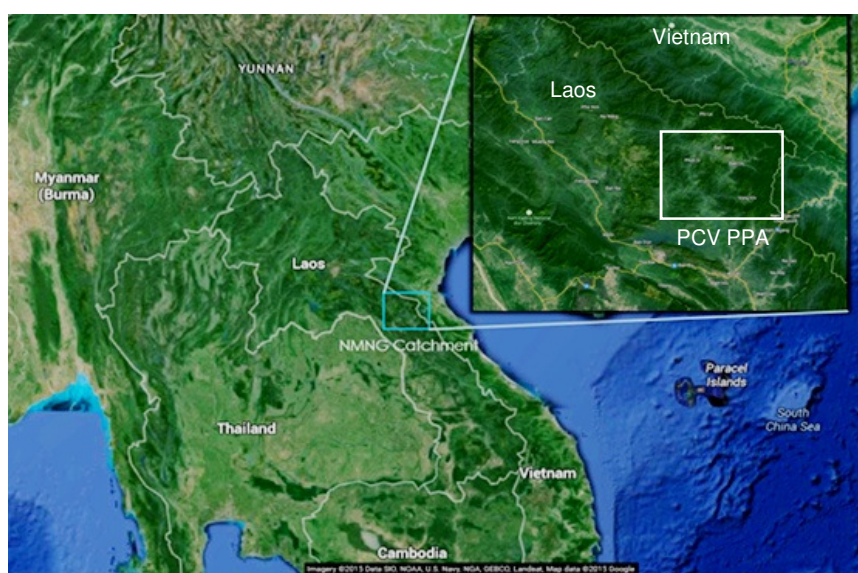
Figure 1. Location of the Phou Chom Voy Provincial Protected Area, Lao PDR. Images adapted from Google Earth.

The PES-project (Section 1) aims to stem illegal activity in the PCV PPA by implementing community-led wildlife patrols to combat poaching (Crawford School of Public Policy, 2015). We predict the impacts of patrols on species in the PCV PPA, since payments for village-based patrols will be based on the likely number of animals and species protected.