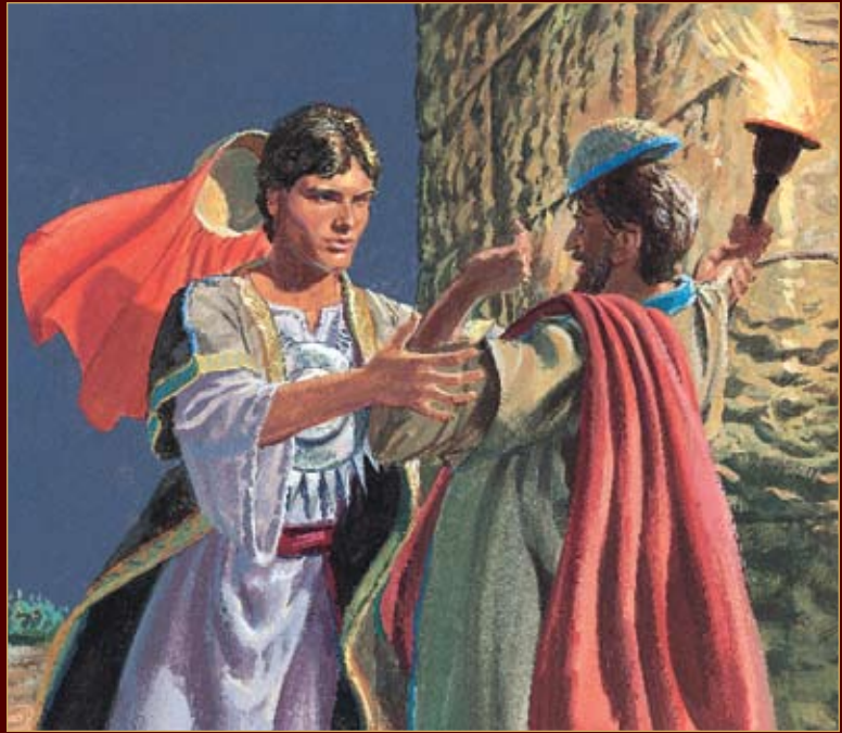
Nephi prevented Zoram from fleeing back into the walls of Jerusalem. The two then swore solemn oaths of loyalty and obedience.

he could not be trusted to act as a dutiful sovereign, carrying out necessary executions of subjects who committed capital crimes or leading his people into battle against brothers and cousins and nephews as he would later be required to do (2 Nephi 5:14; Jacob 1:10). Nephi must prove that he is willing to abide by even this most difficult of commands, for it is only “inasmuch as thou shalt keep my commandments, [that] thou shalt be made a ruler” (1 Nephi 2:22). Unlike Abraham who was spared the horror of sacrificing his son, Nephi cannot be spared, for in a fallen world, sovereign rulers cannot avoid the necessity of using measured violence to protect their people from violence without measure. For a righteous man, being king is hard duty, but through his willingness to do this distasteful deed, Nephi proves that he will be a dutiful king.