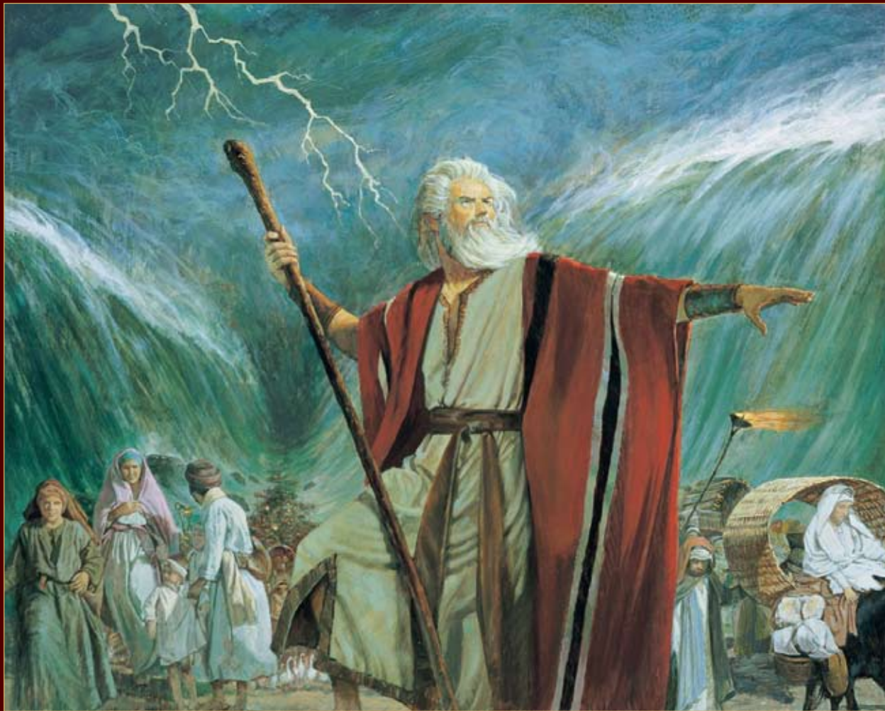
When Moses led the children of Israel out of Egypt, he had already established himself as the sovereign ruler of the people in ways that parallel the story of Nephi and his brothers. Moses Parting the Red Sea , by Robert Barrett.

Bathos is a rhetorical figure in which one suddenly descends from the sublime to the commonplace, often with comic effect, for example, if one were to say, “I solemnly swear that I will support and defend the Constitution of the United States and the Rules of Scrabble against all enemies, foreign and domestic.” Nephi uses bathos to comment on the naiveté of his younger self and to teach a profound lesson on governance to his successors. As noted above, just before he enters the city, young Nephi reminds his brothers of what is probably the most sublime moment in Hebrew history: the moment when Moses raised his staff and spoke to the waters of the Red Sea which then divided to save Israel