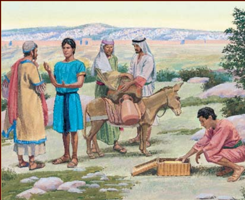
When Zoram and Nephi formed their covenant, Zoram became part of the party of Lehi. Zoram and his descendants remained true to the covenant for hundreds of years.

Like Nephi, each of the three are prophets. Like Nephi, Benjamin wields the sword of Laban in his people's defense and holds them accountable to obey his words, which are the words of God (Words of Mormon 1:12–18). Though he exercises sovereign power like Nephi in punishing those who "murder, or plunder, or steal, or commit adultery," Benjamin has taken care to preserve freedom and equality among his people. He has not permitted them to "make slaves one of another" and he himself has "labored with [his] own hands that [he] might serve [them], and that [they] should not be laden with taxes" (Mosiah 2:13–14). He plainly states that he sees himself as no better than his people: "My brethren . . . hearken unto me. . . . I have not commanded . . . that ye should fear me, or that ye should think that I of myself am more than a mortal man. But I am like as yourselves. . . ." (Mosiah 2:9–11). Thus, the relationship between these last three kings and the people is in every way