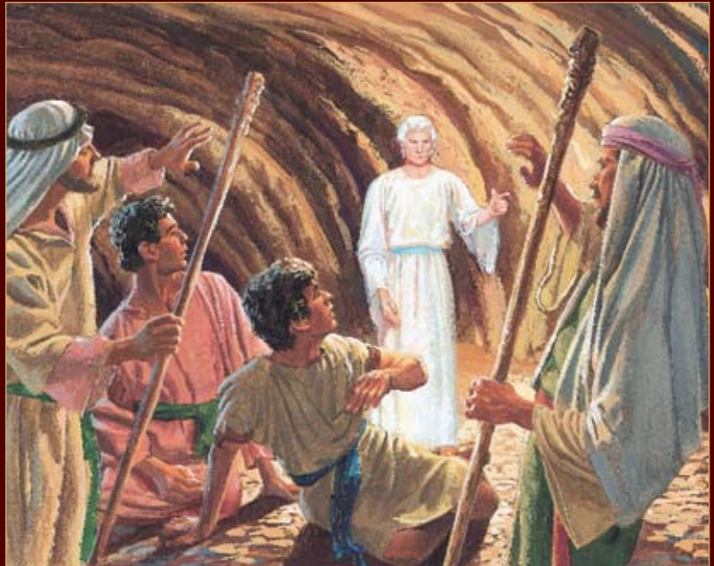
After the second failure to obtain the brass plates, Laman and Lemuel beat Nephi and Sam until they were stopped by an angel, who affirmed Nephi's role as a ruler over his brothers.