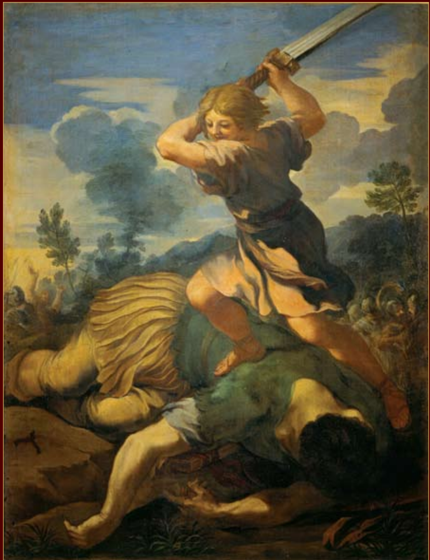
Like Nephi, the biblical David became the leader of the people through slaying a mighty man (Goliath) with his own sword. David Slaying Goliath, by Pietro da Cortona.

If the parting of the Red Sea is Moses's most majestic act, his descent from Sinai with the law in hand is the most important. When Nephi goes down from Jerusalem into the Arabian desert bearing the same law, the parallel with Moses is unmistakable. So in this episode, Nephi becomes not just