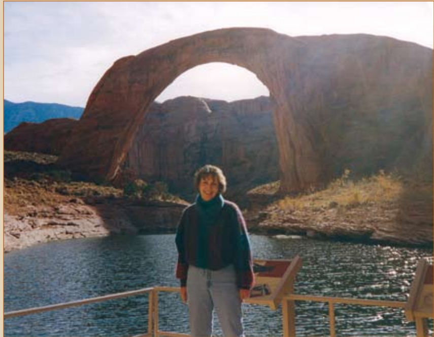
The author at Rainbow Bridge National Monument, Utah.

For some reason I began to pray each night saying the Shema, the sacred Jewish prayer. I did not understand why I did this, but I felt better doing it. I did not realize how