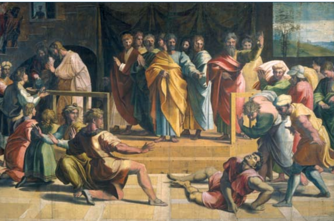
The Death of Ananias , by Raphael.

To be one economically requires that we live as economic equals. As a part of the law of consecration, the Lord commanded, “In your temporal things you shall be equal, and this not grudgingly, otherwise the abundance of the manifestations of the Spirit shall be withheld” (D&C 70:14; see 42:30). The Lord also revealed to Joseph Smith that unless the Saints were equal in earthly things, they could not be equal in obtaining heavenly things (see D&C 78:6).