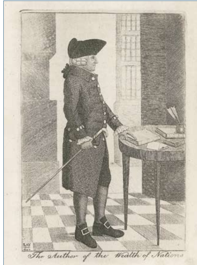
Frontispiece and title page from Adam Smith’s influential book The Wealth of Nations .

Economists are remarkably agreed on the requirements for attaining economic prosperity. Adam Smith, an 18th-century Scottish moral philosopher, laid the foundation for much of modern economics in his book The Wealth of Nations , published in 1776. The book describes three conditions