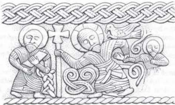
Figure 3. God the Father, holding a book, is approaching Christ, who has the dove of the Holy Spirit on his shoulder. Christ holds Adam by the wrist and strides over the shattered gates of hell. c. 1150, Eardisley, Herefordshire