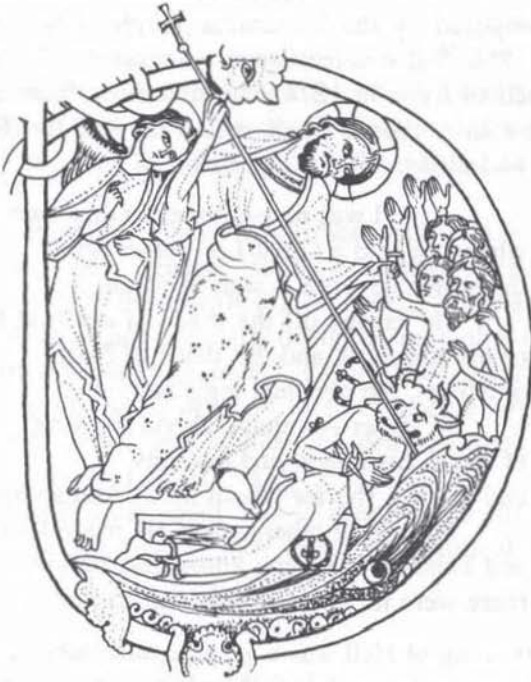
Figure 2. Christ drives his cross-staff into the open jaws of hell, while he grasps Adam, with Eve at his side. The devil lies bound on the shattered gates under Christ's feet. 1150–1175, Winchester Bible