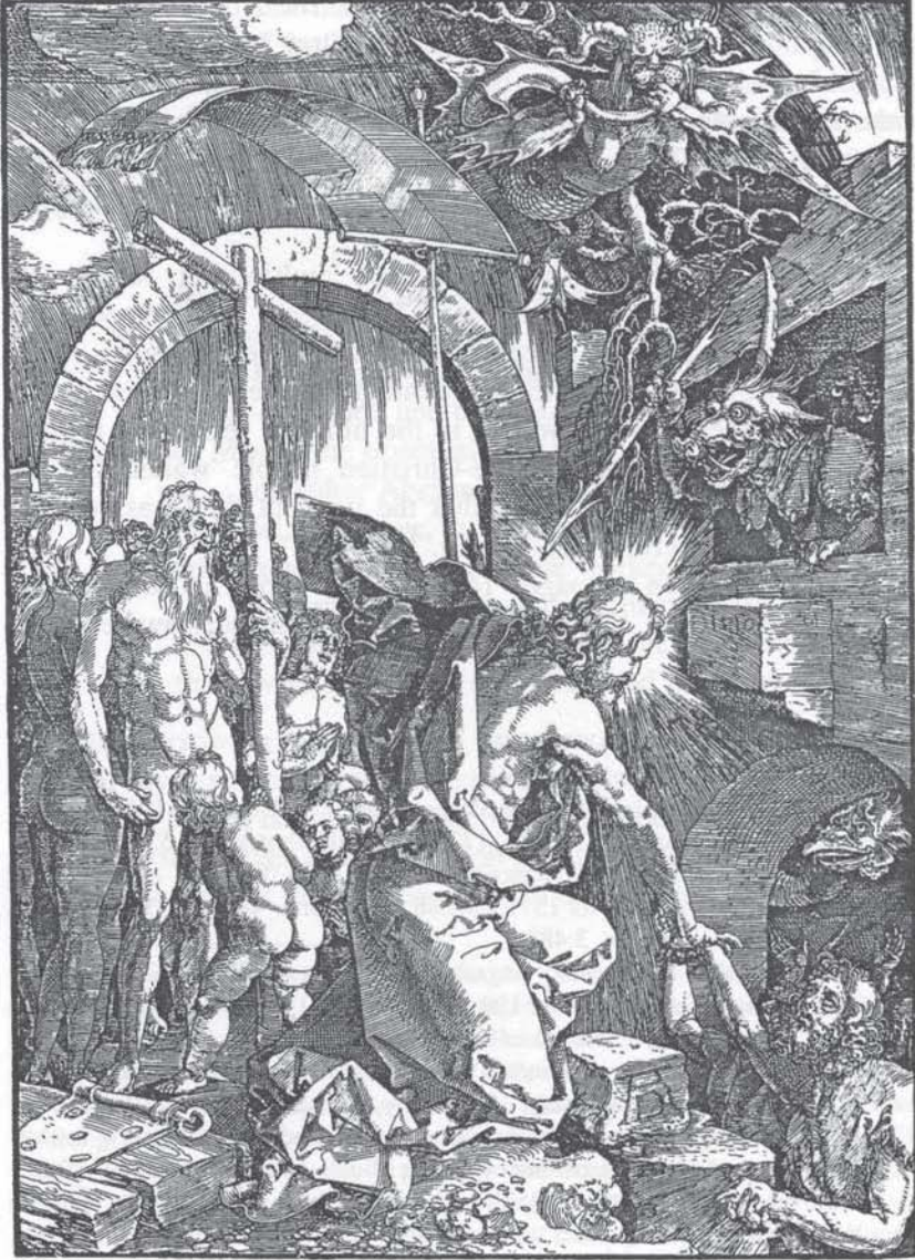
Figure 4. In this 1510 version of Christ in limbo, Albrecht Dürer shows Christ kneeling to extend his hand to those who sat in darkness. Adam, holding the cross, and Eve stand next to the shattered doors of hell.