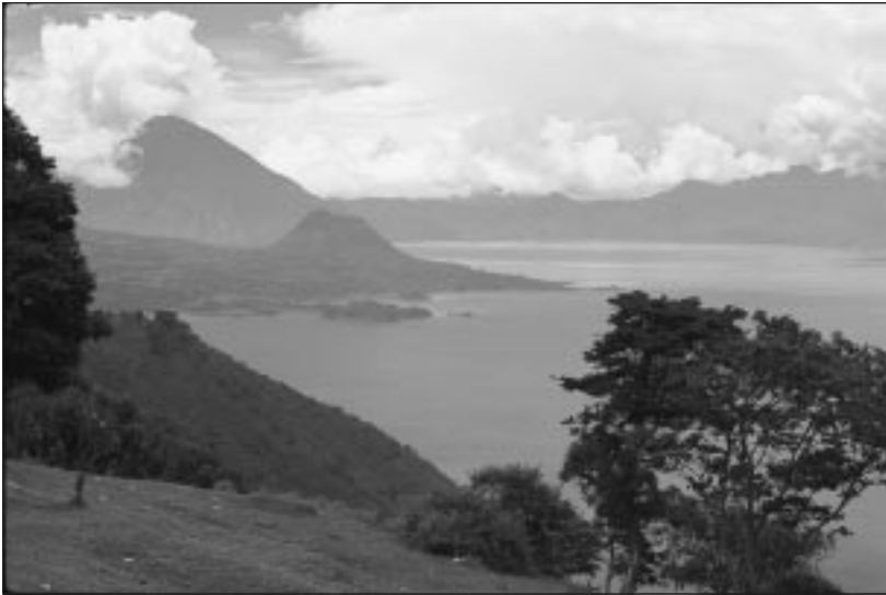
Submerged just off the southern coast of Guatemala's scenic Lake Atitlán is an ancient settlement of stone buildings that suggests an intriguing possible linkage with the Book of Mormon city of Jerusalem, an apostate Lamanite city destroyed by sudden flooding.