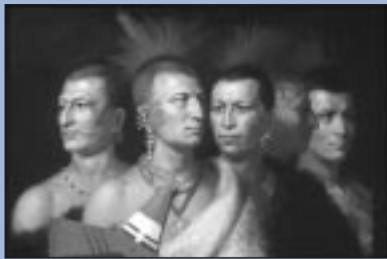
Charles Bird King, Young Omahaw, War Eagle, Little Missouri and Pawnees (1821), Smithsonian American Art Museum