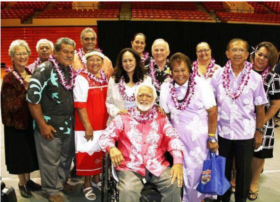
"Johnny Lingo" cast and crew members gather at the recent reunion in Laie.