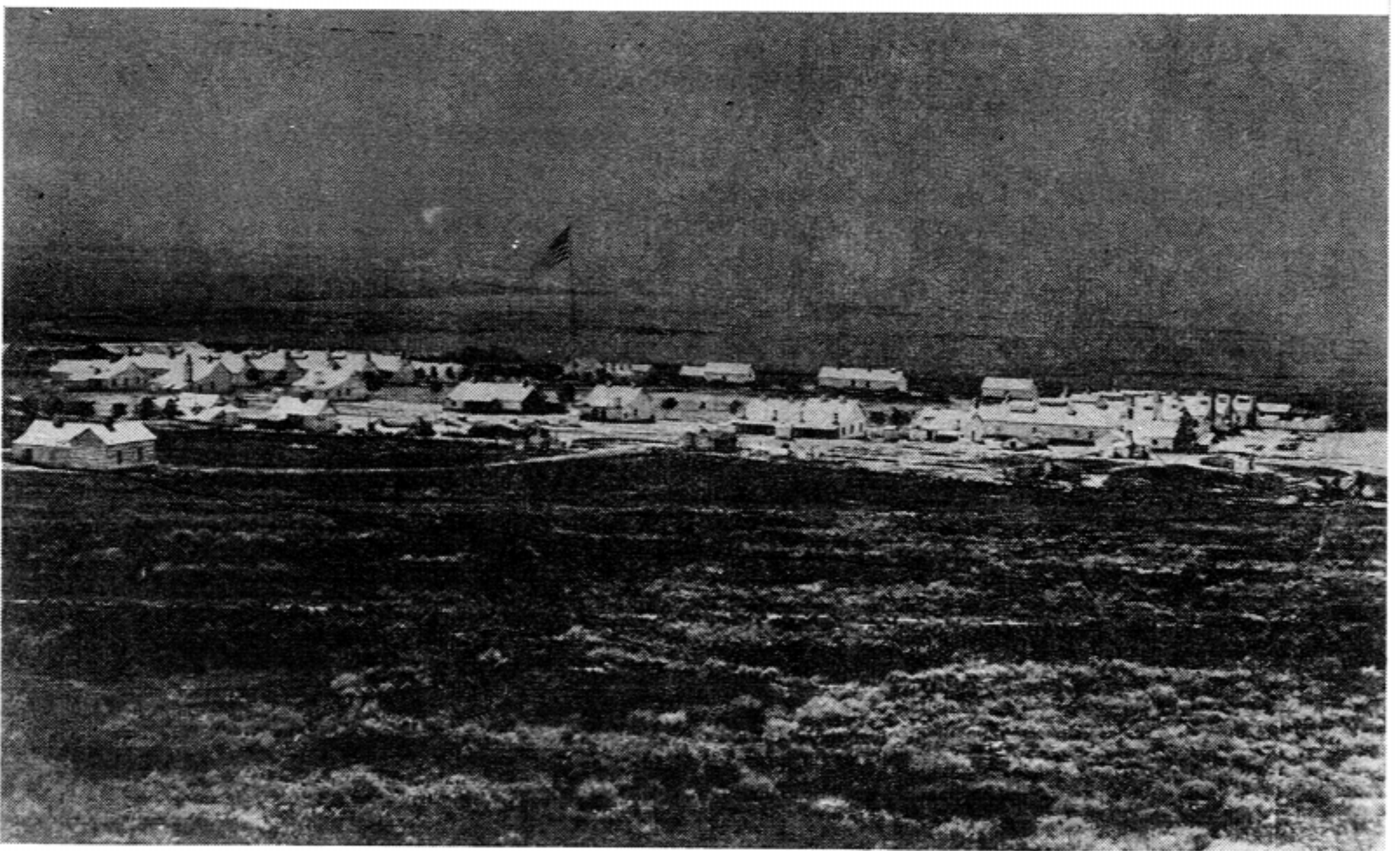
Looking southwest at Old Camp Douglas in 1868.

Some Mormon leaders predicted the rapid demise and early departure of the California boys, but in the meantime, Connor prepared for the duration. With months slipping by, and no apparent departure in sight, the saints were not long in perceiving that Uncle Sam's soldiers could contribute in a direct way to the city's economy, particularly when the paymaster made one of his infrequent visits. Newspapers of the time re-