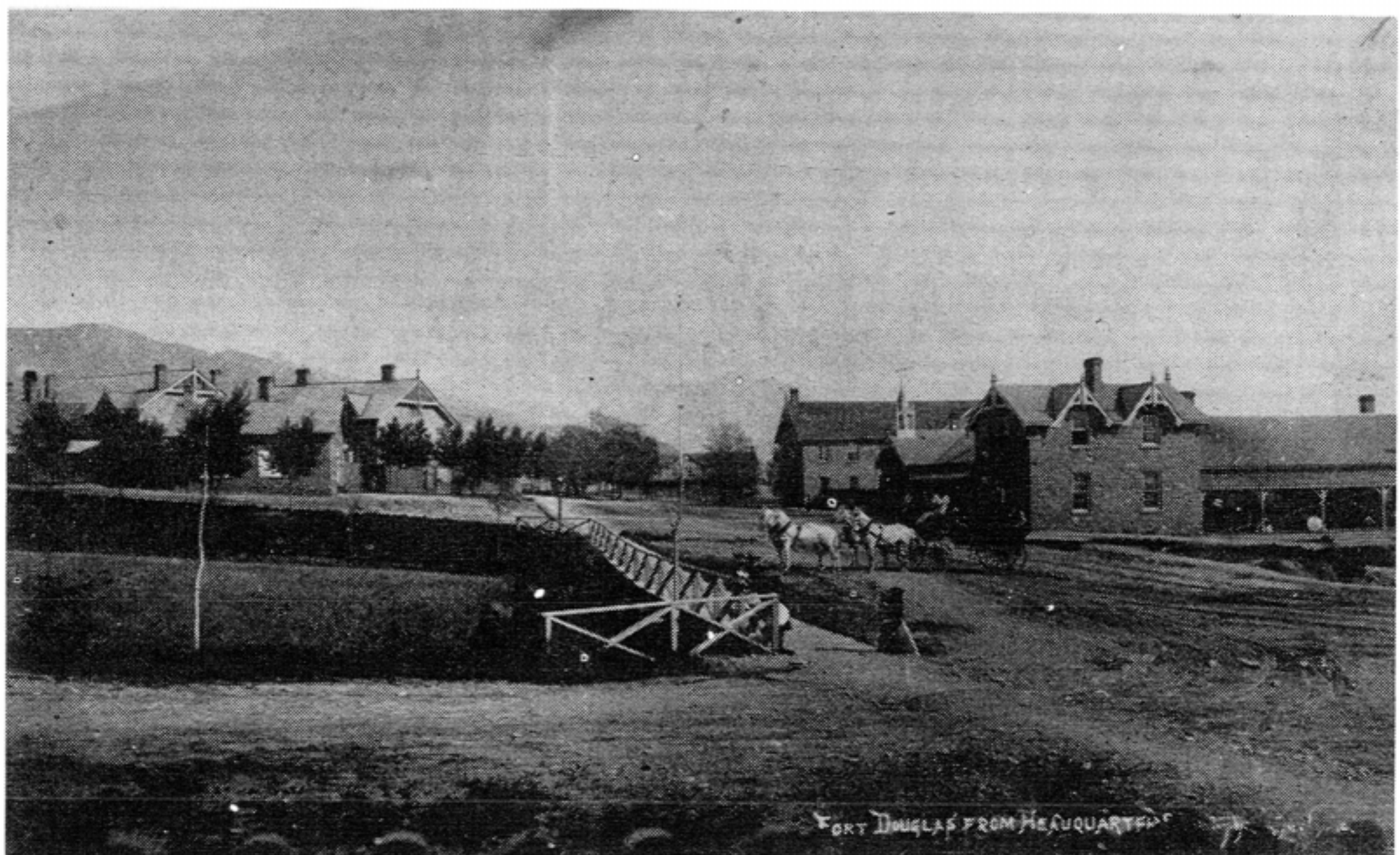
Fort Douglas from Headquarters about 1885.

Soldiers sent to the Wasatch frontier were no different than those sent on countless Indian trails in the West, to the Philippines, the Argonne Forest, Bastogne, Seoul, or the Mekong Delta. Most of them who came to Utah bore no particular