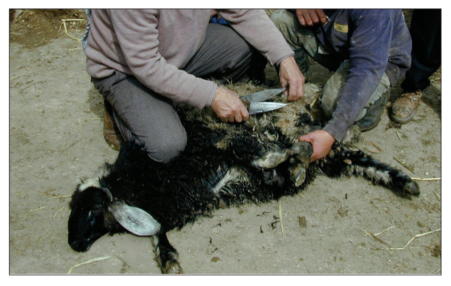
Modern shearers still find sheep to be passive and quiet.

Though the Savior's grave was with the wicked, he was the ultimate innocent one quietly meeting the demands of justice for the guilty. "He had done no evil, neither was any deceit in his mouth" (Mosiah 14:9; compare Isaiah 53:9). His soul was made an offering for the sins of many whom he would one day see and own. The many would be those who had chosen to seek and know him and give away their sins to become like him. The day would come when he, as heir, would divide all he had been given with those who had willingly taken upon them his name.