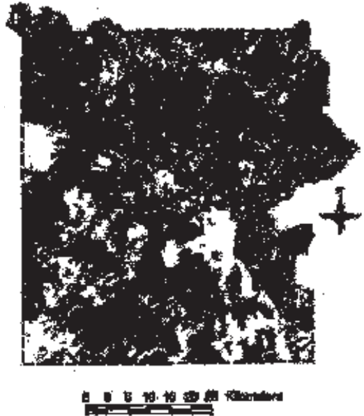
Fig. 3. Potential distribution of Melilotus officinalis (yellow sweetclover) in Yellowstone National Park. Gray areas show the distribution of disturbed areas where it is expected to occur in less than half a series of study plots. No areas occurred where it would be capable of occurring in more than half the study plots. Black areas show distribution of those sites where it is capable of invading climax vegetation. Roads are indicated (solid line) for reference. Actual locations recorded by Yellowstone's weed management staff are shown by triangles.

validated by noting that the majority of locations mapped by the Yellowstone National Park weed management staff are within the areas we mapped as potential habitat. Anomalous colonies in dry grassland/shrubland units may be located within inclusions of wetter environmental types.