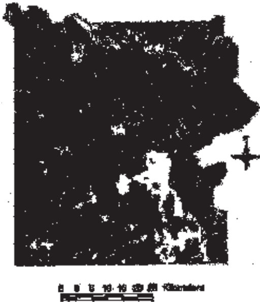
Fig. 4. Potential distribution of Phleum pratense (timothy) in Yellowstone National Park. Light gray areas indicate where it is expected to occur in less than half a series of study plots. Dark gray indicates areas where it is expected to occur in more than half the study plots. Black areas show distribution of those sites where it is capable of invading climax vegetation. Roads are indicated (solid line) for reference.

members do not map it, actual location data for this widespread species are not available for validation of our maps. While it is of little concern in the forested types because it would be greatly reduced at canopy closure, it could be of major concern in moister grassland/shrubland environments, which are the major source of forage for native ungulates.