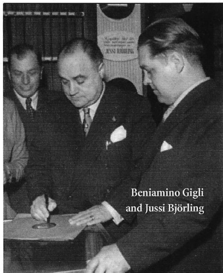
Beniamino Gigli and Jussi Björling

The JBS-USA is honored to have Mr. Heppner as one of its Honorary Advisors.