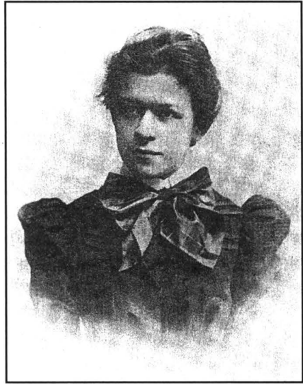
Mileva Marić in 1896.

Their correspondence gave insights into their relationship. At the time, Einstein was a handsome, healthy, and energetic young man at the height of his vigor. In contrast, Mileva was not considered attractive, and one friend even called her ugly. She was short, walked with a limp, and had suffered some kind of lung ailment, perhaps tuberculosis, that made her sickly. One of the reasons she came to Zurich might have been to improve her health by breathing the clean mountain air in the Alps nearby. Einstein's interest in Mileva surprised at least one of his friends who admitted, "I should never have the courage to marry a woman unless she was absolutely sound." To which Einstein responded, "But she has such a lovely voice." 20