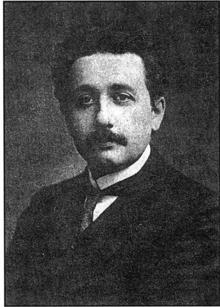
Einstein in 1912.

Einstein's creativity continued after the miracle year of 1905 when he was still working in the Patent Office. In 1906, he published an additional five articles in the Annalen der Physik . In 1907 he published seven articles; in 1908, four articles; and in 1909, he published four. The year 1907 proved to be a particularly fruitful year, when he had "the happiest [luckiest] thought in my life." 39 He explained how he came upon an exciting idea. "I was sitting in a chair in the patent office at Bern when all of a sudden a thought occurred to me, 'If a person falls freely he will not feel his own weight.' I was startled. This simple thought made a deep impression on me. It impelled me toward a theory of gravitation." Einstein's sudden insight made him realize that gravity and acceleration were identical. He published his initial findings in an article in the Jahrbuch der Radioaktivität und Elektronik (Yearbook of Radioactivity and Electronics) in November of that year. 40