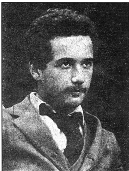
Albert Einstein in 1896.