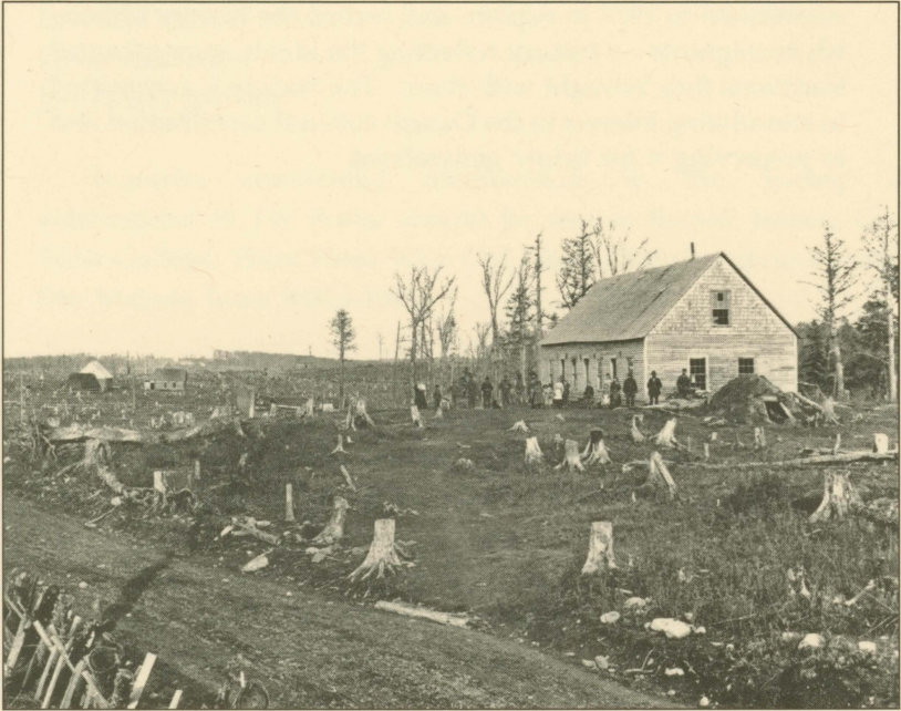
Danish Immigrants in New Denmark, New Brunswick

Journal of the Danish American Heritage Society