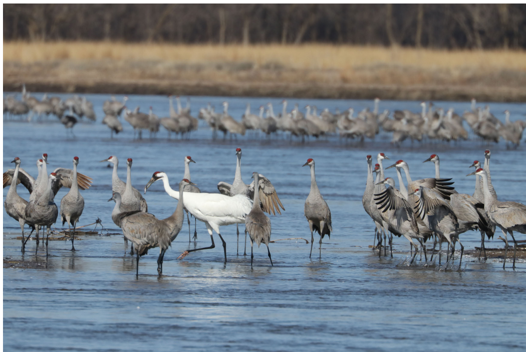
Fig. 1. Photo of an adult Whooping Crane ( Grus americana ), with a channel catfish ( Ictalurus punctatus ; estimated at just over one year old) in its bill, moving among Sandhill Cranes ( Antigone canadensis ) on 22 March 2018 at about 10:30 on the main channel of the Platte River, Hall County, Nebraska, USA.

add to the sparse information concerning Whooping Crane diet during migration by describing an observation novel to the scientific literature regarding an adult feeding on multiple juvenile channel catfish ( Ictalurus punctatus ) in the CPRV.