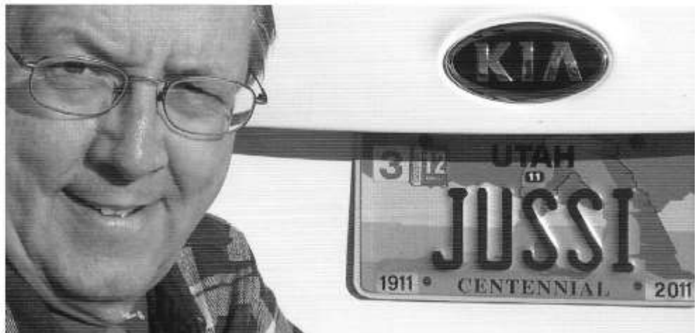
Altered for the Jussi centennial