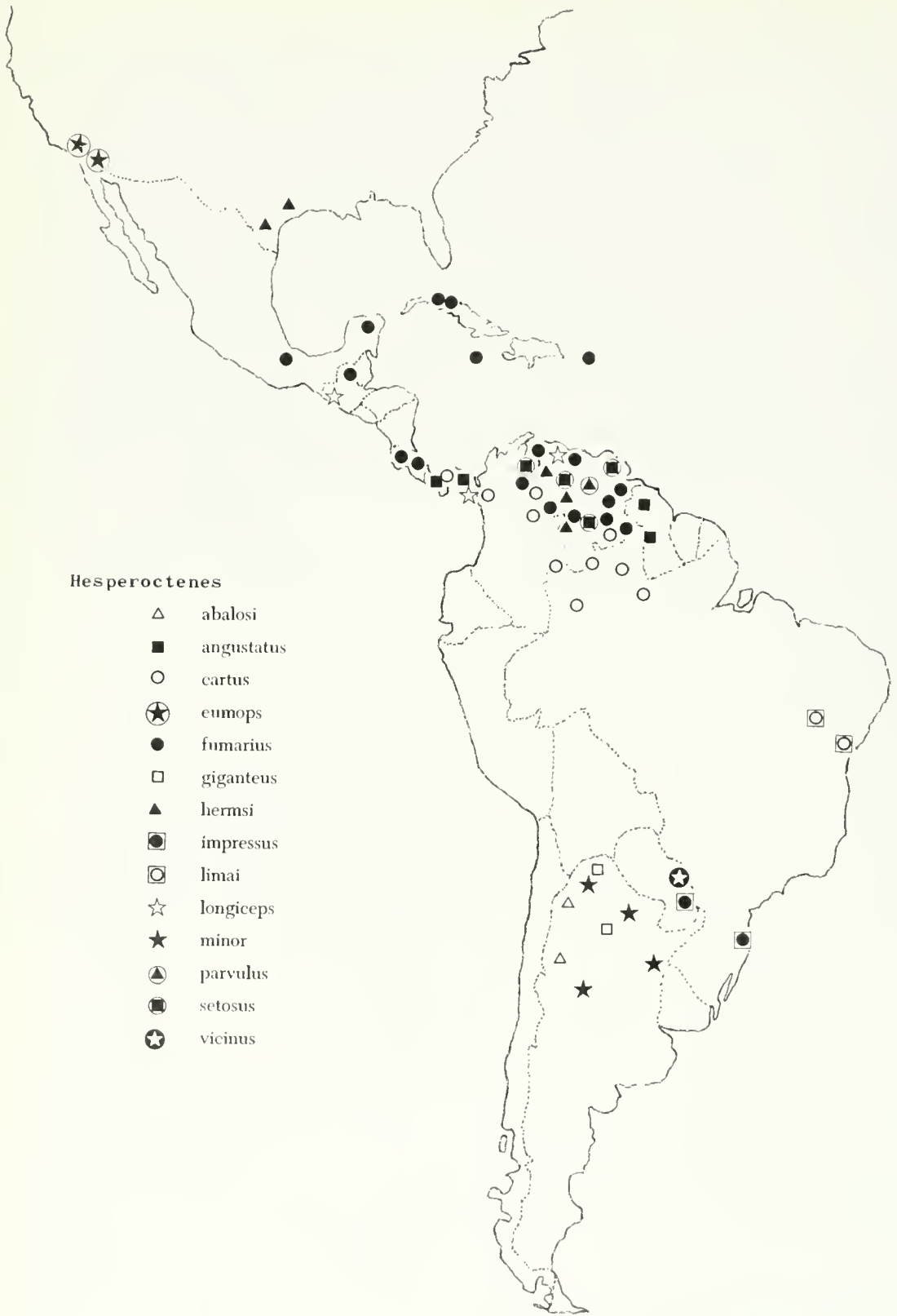
Fig. 2. Distribution map of Hesperoctenes species.