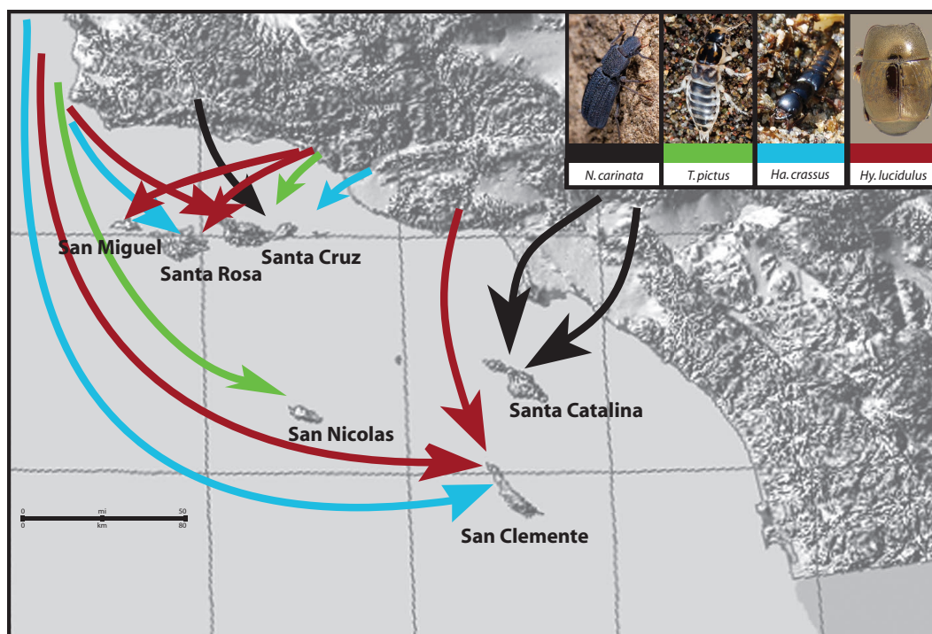
Fig. 3. Summary diagram showing hypothesized connections among islands and mainland for Nyctoporis carinata , Thinopinus pictus , Hadrotus crassus , and Hypocaccus lucidulus . Arrows represent reconstructed colonization events where mainland origin was unambiguous, as revealed by parsimony mapping on phylogenetic relationships among mtDNA haplotypes. Colored arrows are coded by species (see inset).

A second smaller cluster in Ha. crassus comprised 2 haplotypes: one (haplotype 2) was very widespread, again covering northern and southern islands as well as central and northern mainland areas. These 2 divergent clusters were weakly linked by a single haplotype from Santa Cruz Island (haplotype 17), which was not closely related to anything else.