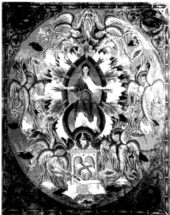
Figure 1. Vision of Isaiah (11th century; Reichenau, Germany)

Isaiah records, "I saw also the Lord sitting upon a throne, high and lifted up" (2 Nephi 16:1, parallel to Isaiah 6:1). Figure 1, an eleventh-century illustration of the vision of Isaiah, from the cathedral in Reichenau, Germany, depicts the Lord seated high on his throne, surrounded by a