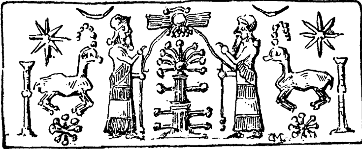
Figure 4. Cosmic tent spread over the sacred tree of life

concerning Jerusalem—that it should be destroyed, and the inhabitants thereof” (1 Nephi 1:11–13; compare Ezekiel 2:9–10). John also saw in vision “a book . . . sealed with seven seals” (Revelation 5:1) and was commanded to “Go and take the little book . . . and eat it up; and it shall make thy belly bitter, but it shall be in thy mouth sweet as honey” (Revelation 10:8–9).