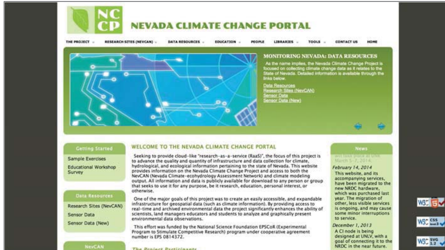
Figure 2. The landing page of the Nevada Climate Change Portal. The NCCP landing page provides quick access to everything that the portal has to offer.

Upon reaching the landing page of the site, the banner at the top of the page provides quick access to resources that many segments of users are likely to find valuable – as can be seen in Figure 2, where the banner provides quick access to data resources. The landing page also includes news events related to portal development and operations, a summary of the project and available resources, and links to several frequently used pages. As an example of such a page, we can see in Figure 3 below the "Equipment and Sensors" page, which is an interactive visualization of a typical sensor site deployed in Eastern Nevada. Through this page, users are able to learn about the technology that enables the NCCP to monitor climate conditions, and are able see how modern climate science is done.