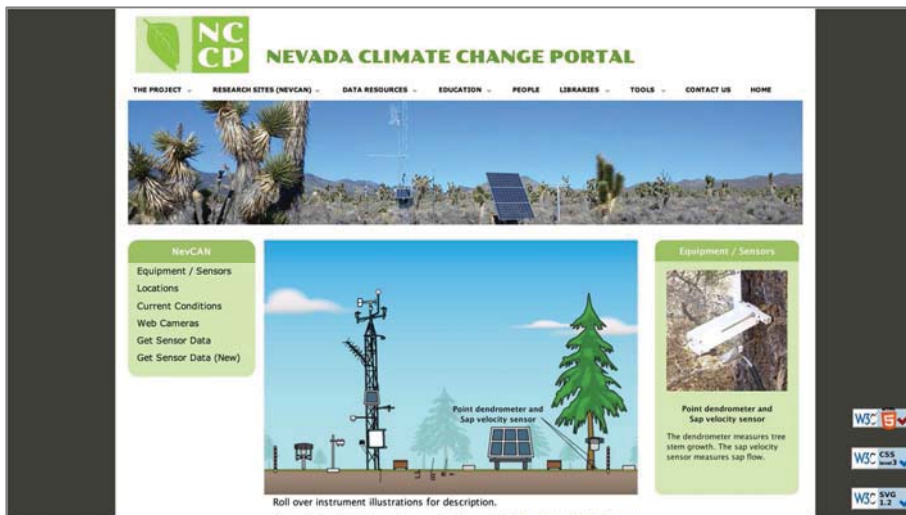
Figure 3. The "Sensors and Equipment" page shows users the hardware that we have deployed to the field.

Upon reaching the landing page of the site, the banner at the top of the page provides quick access to resources that many segments of users are likely to find valuable – as can be seen in Figure 2, where the banner provides quick access to data resources. The landing page also includes news events related to portal development and operations, a summary of the project and available resources, and links to several frequently used pages. As an example of such a page, we can see in Figure 3 below the "Equipment and Sensors" page, which is an interactive visualization of a typical sensor site deployed in Eastern Nevada. Through this page, users are able to learn about the technology that enables the NCCP to monitor climate conditions, and are able see how modern climate science is done.