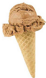
3.1 High-calorie food pictures