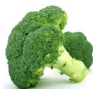
3.2 Low-calorie food pictures