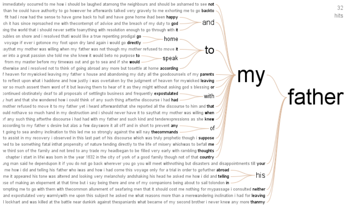
Figure 5. Word Tree for “father” from Chapter 1 of Robinson Crusoe