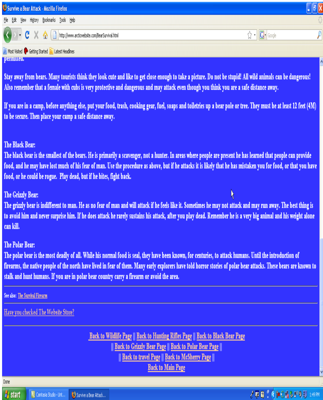
Figure 2. Screen Capture of Bobby Clicking on the Link Back to Hunting Rifles