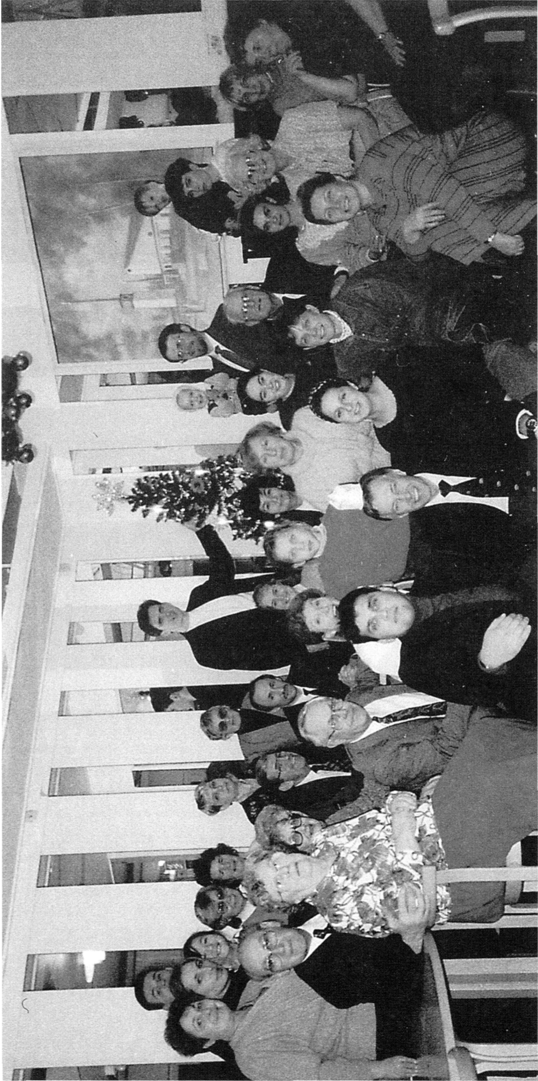
Russian Saints and temple missionaries, December 1995 or 1996. A group of visiting Saints gather for a social with resident temple missionaries in the guesthouse of the Stockholm Sweden Temple.