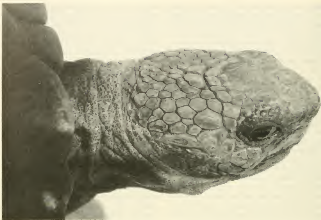
Fig. 2. Dorsolateral view of the head of BYU 39707, showing the small, smooth frontal and prefrontal scales and the abrupt transition to the thickened, raised parietal and temporal scales.

X. lepidocephalus reflect primitive or derived conditions within the genus.