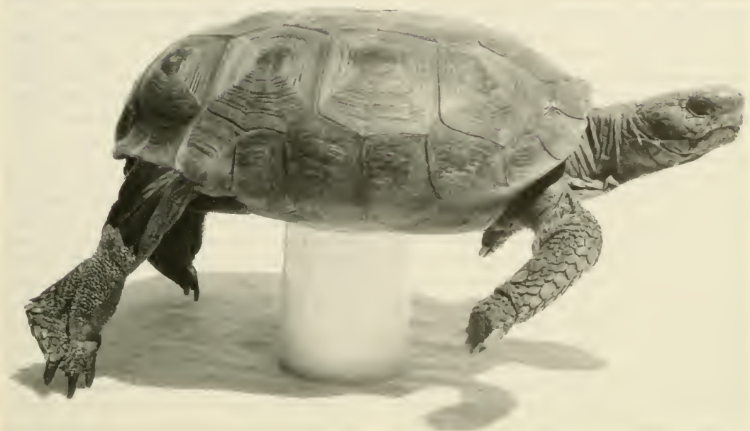
Fig. 1. Xerobates lepidoccephalus : holotype, BYU 39706, from near the Buena Mujer Dam, Baja California Sur.

examined 29 live specimens of G. agassizii (5 specimens from Sonora, 24 from California), 6 live X. berlandieri , 1 live G. flavomarginatus , and 1 live G. polyphemus . Photographs of other specimens were also used to aid in our diagnoses and include: 18 X. agassizii (11 from USA and 7 from Sonora), 4 X. berlandieri , 3 G. flavomarginatus , and 5 G. polyphemus . Shell terminology was taken from Woodbury and Hardy (1948) and Carr (1952). Bone terminology follows Auffenberg (1966, 1976) and Bramble (1982). Shell measurements were taken following Woodbury and Hardy (1948), using a high-quality, steel meter stick "in planes parallel to or at right angles to a flat surface upon which the tortoise was resting" (Woodbury and Hardy 1948: 154). Head measurements were taken using a Venier caliper at the widest part of the head (width) and from the tip of the snout to the posterior border of the parietal scales (length). Hindlimb length was taken by measuring the distance from the edge of the plastron to the base of the first nail when the limb was fully extended. Figures depicting cranial, vertebral, and carpal characters were taken from radiographs and/or adapted from Bramble's (1982) ink drawings.