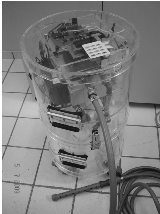
Figure 1. Front view of the automatic water sampler.

The basic equipment was conceived to provide an automatic water sample collection, previously defined by the user. For this purpose, a control system composed by two main components was developed: a) control system and data acquisition; b) sample collection and distribution system. Control system provides an interface with the user by using a keyboard and a LCD. Once sampling procedure is being made, an ultrasonic sensor provides the sampler water level data as a function of time.