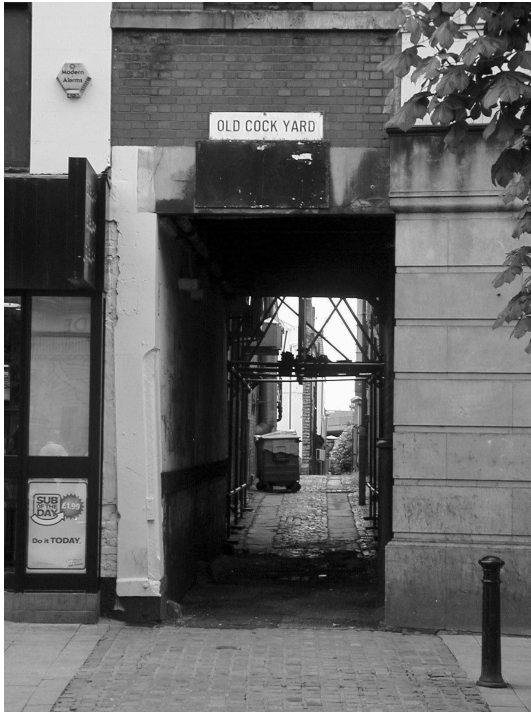
Old Cock Yard Street, Preston, England, 2006. Alexander and Ellen Neibaur were living on this street at the time of their conversion to Mormonism in 1838.