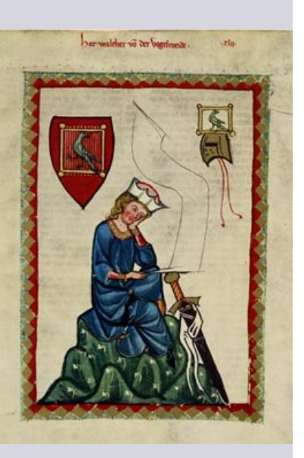
Sheet from Codex Manesse, University of Heidelberg.