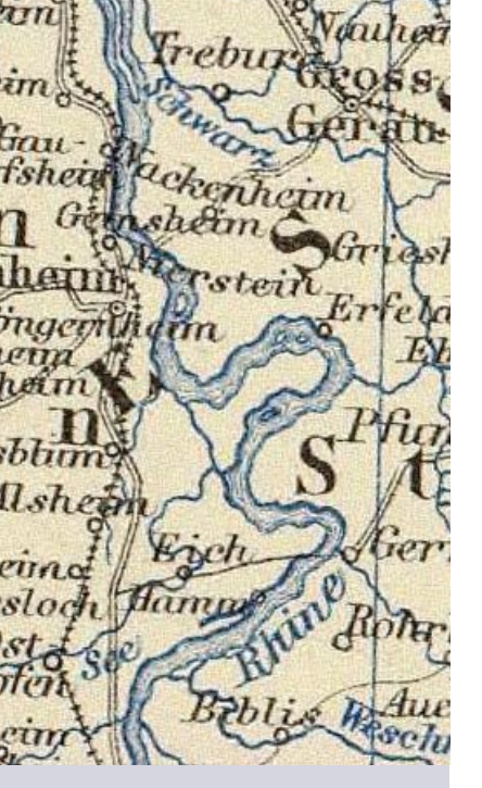
Maps from Royal Atlas , 1861, courtesy David Rumsey maps at www.davidrumsey.org.