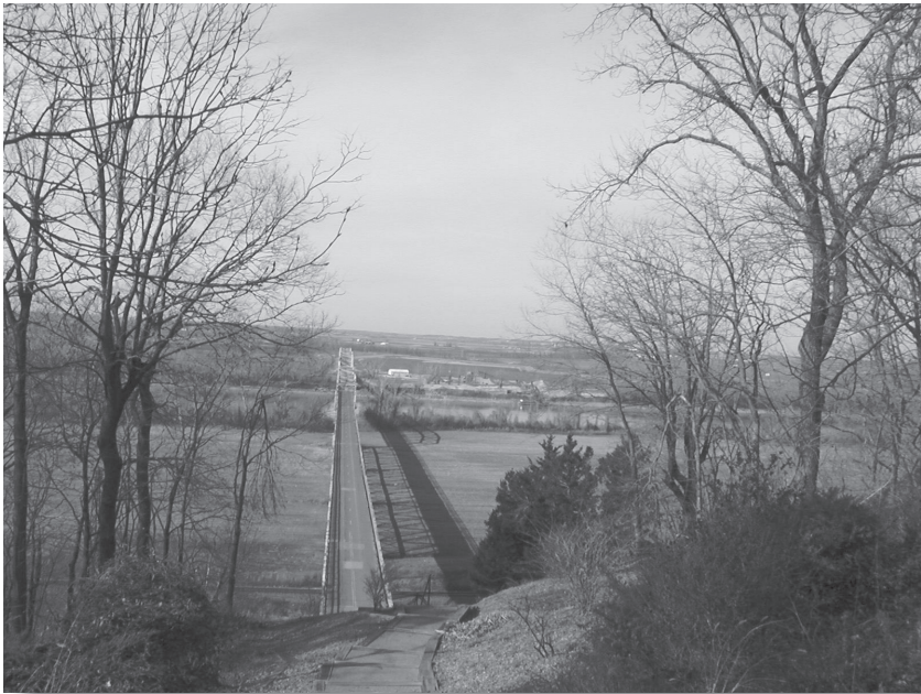
Missouri River near Lexington, Missouri, approximate site of the Saluda disaster, 2003.