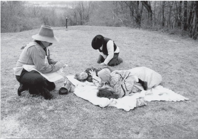
Local Lexington residents participating as actors in the filming of the documentary Fire and Redemption: The Explosion of the Steamboat Saluda , 2003.

Getting ready for the sesquicentennial commemoration also provided opportunities for Lexington citizens and Latter-day Saints to work together. For example, reflecting back on the efforts to prepare the ground and beautify Heritage Park for the Saluda memorial to be erected, Lexington resident Brant