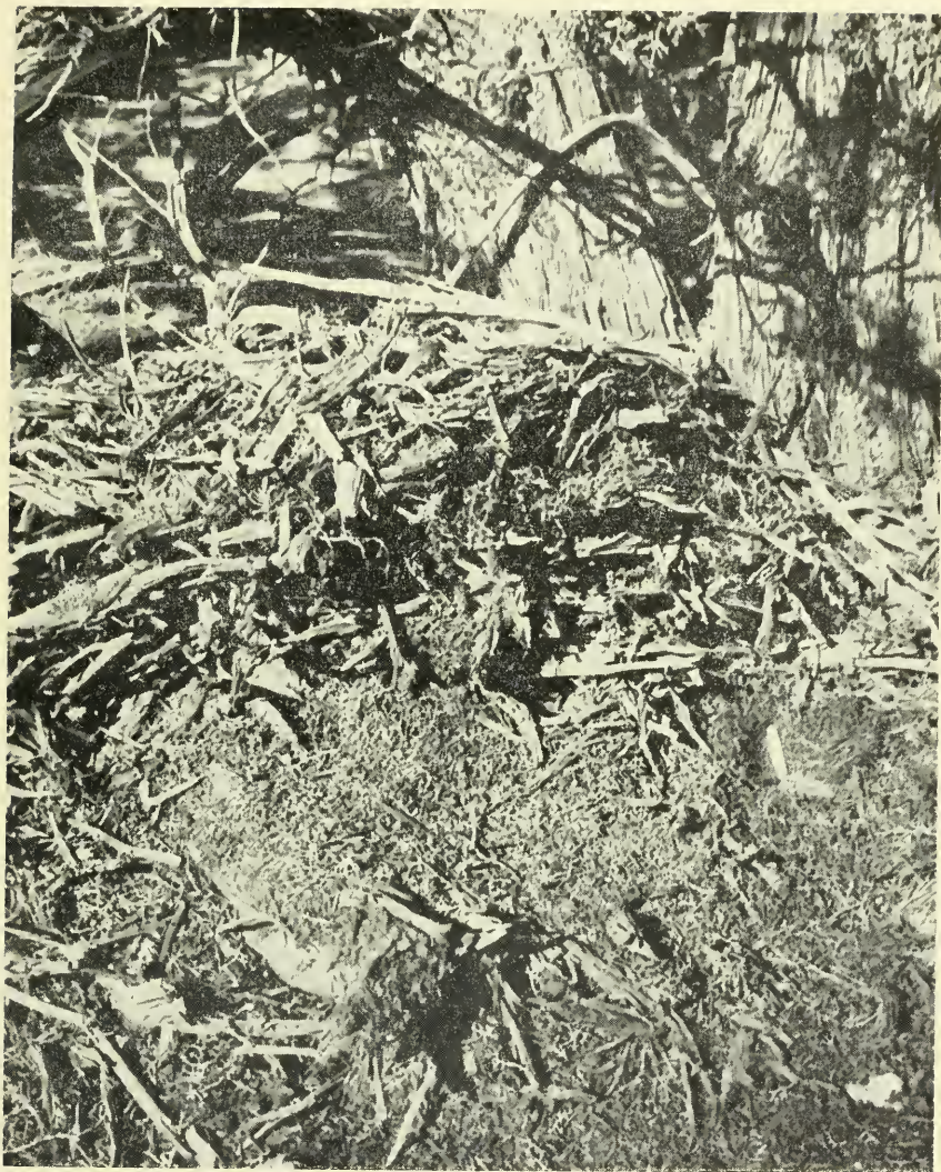
Fig. 3. Cutaway of woodrat house showing the position of nest (scalpel) and burrows.