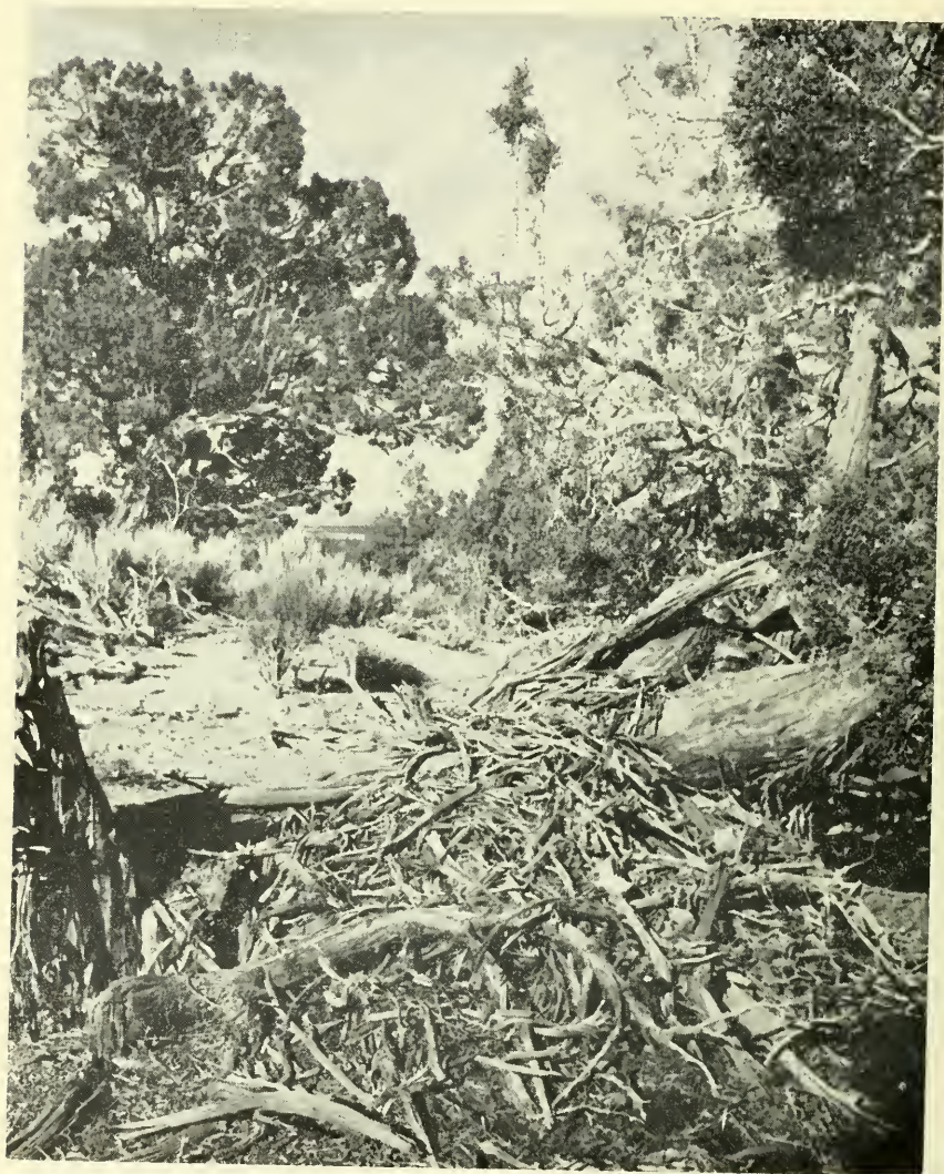
Fig. 2. The woodrat house.