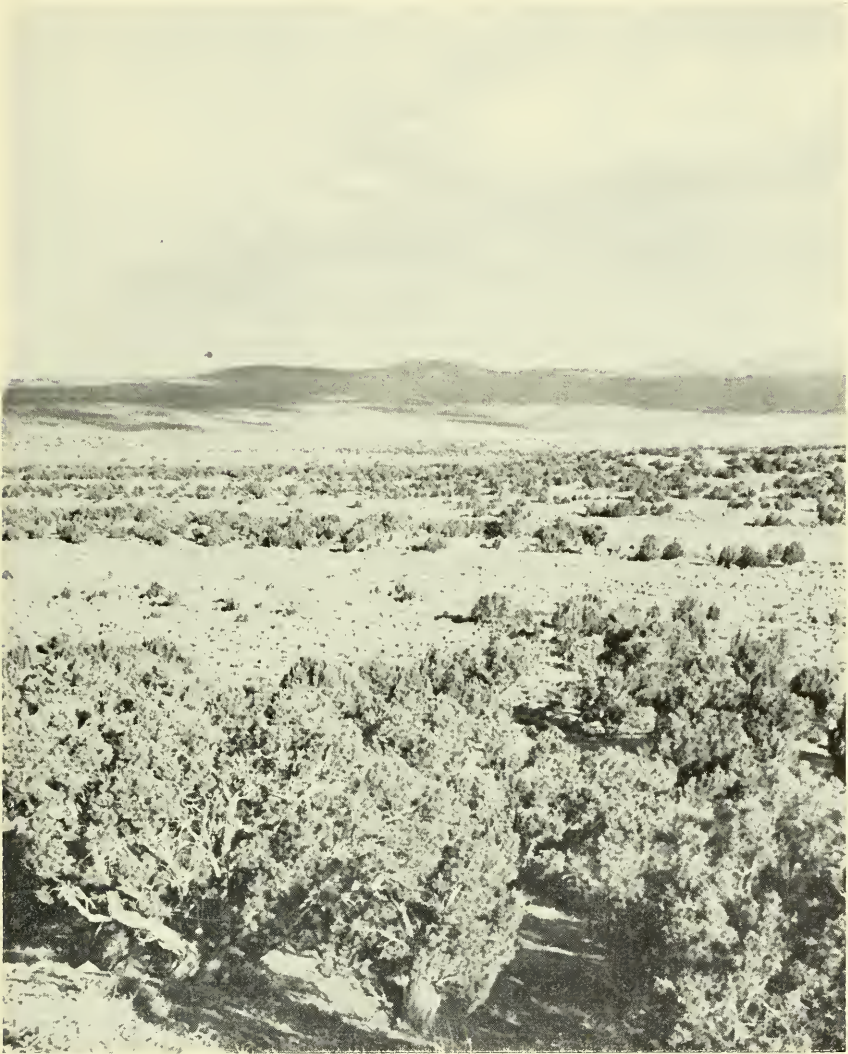
Fig. 1. Study area, a typical sagebrush-juniper community.